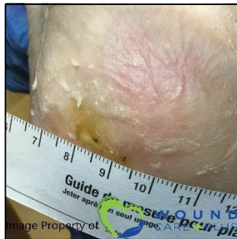
After Picture June 1, 2018